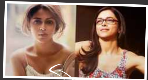
Amala Paul / Deepika Padukone

If you have been wondering if Deepika has got a lookalike? Well, she has. Meet Amala Paul, a well known name in South Indian film industry. Amala might not have Deepika's dimples but her gorgeous smile and beautiful eyes match that of Deeps leaving us with no doubt that she surely looks like the Bollywood diva.