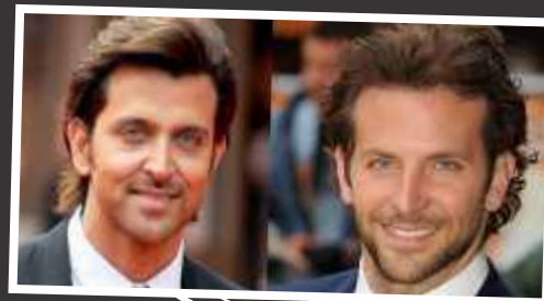
Hrithik Roshan / Bradley Cooper

The handsome hunk has got a handsomer lookalike. Yes, Hrithik Roshan has often been compared to Hollywood actor Bradley Cooper. The eyes, the jaw lines and amazing personalities make both of them very similar to each other in looks.