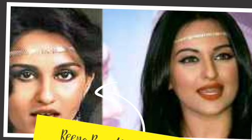
Reena Roy / Sonakshi Sinha

Sonakshi Sinha, shares lots of similarities with Reena Roy, a popular name in the Indian film industry during the 70s and 80s. Although Reena Roy has refused to acknowledge it the striking resemblance has given rise to rumors that Sonakshi is Reema's daughter.