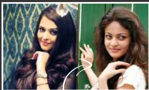
Aishwarya Rai & Sneha Ullal

Do you remember Sneha Ullal, the girl from the movie lucky opposite Salman Khan? The former Miss Universe Aishwarya Rai Bachchan shares lots of resemblance with her. Sneha has appeared in both Tollywood as well as Bollywood films.